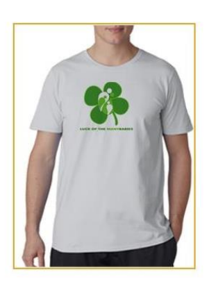
THE LUCK OF MANYBABIES $25.00