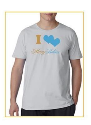
I LOVE MANYBABIES $25.00