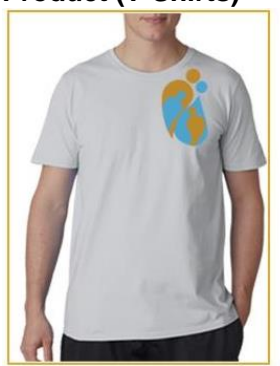
MANYBABIES LOGO $25.00