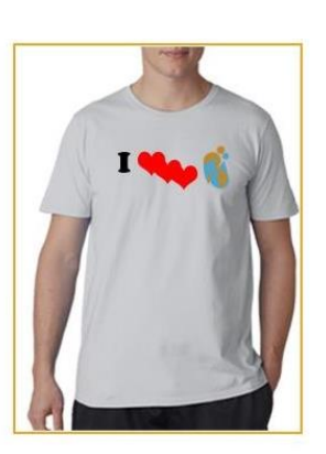
MANYBABIES LOGO $25.00